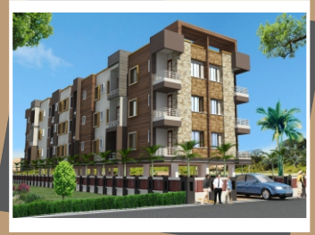
Ravi Prem Enclave AT Chandra Shekhar Nagar Gola Road Patna