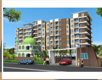
Neyaz city Phulwari Patna