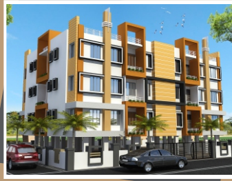
Avatar Residence Mahuabag Patna