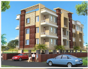
N.D.S Residence Beur, Patna